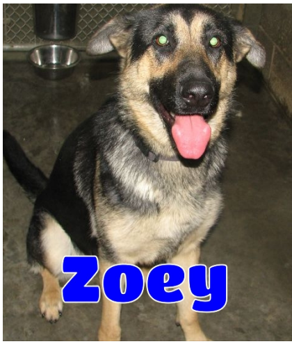
#3594 Zoey German Shepherd Dog Female

"Hi. My name is Zoey and I'm a beautiful german shepherd girl who is looking for a new home. My owner was elderly and couldn't take care of me anymore, so I'm hoping to find a young family to adopt me."