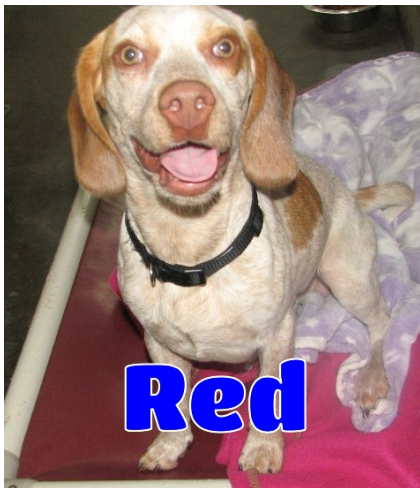
#3596 Red Beagle Male

"Hi. My name is Stash and I came here with my sister Sherry. We're about three years old. Its a little unnerving being here right now, so we're still a bit shy, but we warm up quickly and we're both really sweet kitties."