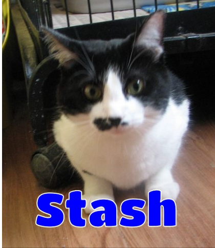
#5131 Stash Domestic Short Hair Male

"Hi. My name is Zoey and I'm a beautiful german shepherd girl who is looking for a new home. My owner was elderly and couldn't take care of me anymore, so I'm hoping to find a young family to adopt me."